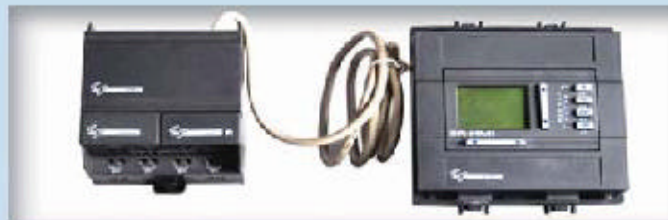
LCD remote panel