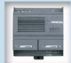
Telephone and voice device